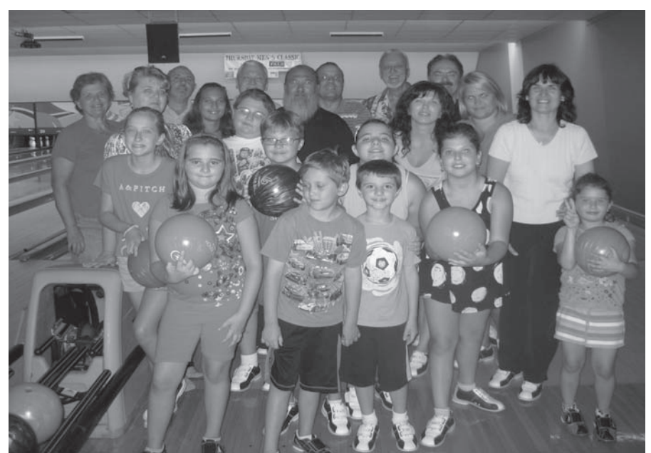
picnic). Wednesday summer evenings are nice in that we plan a potluck dinner and just have a time to touch base. We usually have a small consistent group that comes to the hall and sometimes we simply sit and talk. This year we planned one game night. If you know anything about the Philadelphia UOL chapter fun is a key ingredient of our events.

Autumn is upon us and the busy season for St. Vladimir's Senior UOL Chapter in Philadelphia is fast approaching. During the summer months chapter members gather every Wednesday to complete small projects. This summer we did the same with some Wednesdays focusing on cleaning out the refrigerators and kitchen, other days setting schedules for the coming year and other times preparing for our parish events (like our Basket Raffle and